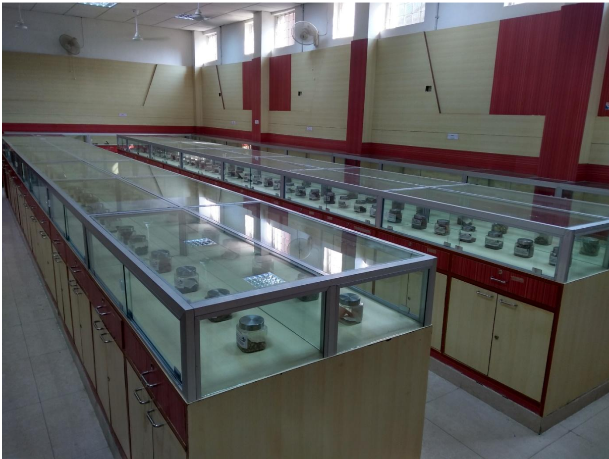
The Repository of Department of Rasa Shastra & Bhaishajya Kalpana Displaying Genuine Samples of Various Metals and Minerals used in Ayurvedic Preparations.