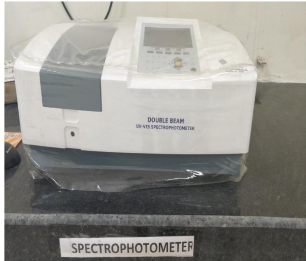
Some of the Instruments being used in the Drug Research Laboratory of Department of Rasa Shastra & Bhaishajya Kalpana for Teaching and Research Activities.