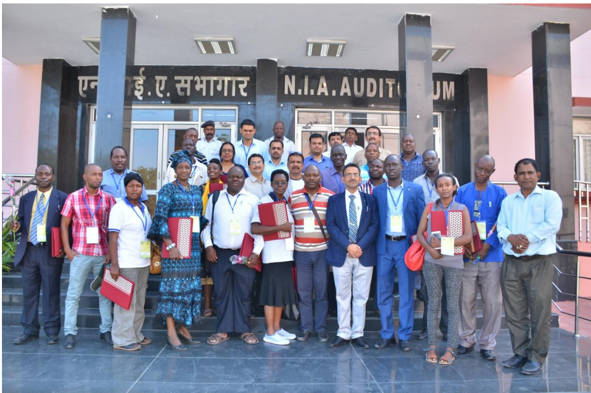
The Drug Regulators from different African Countries during their visit to the Institute under India-Africa Forum Summit.