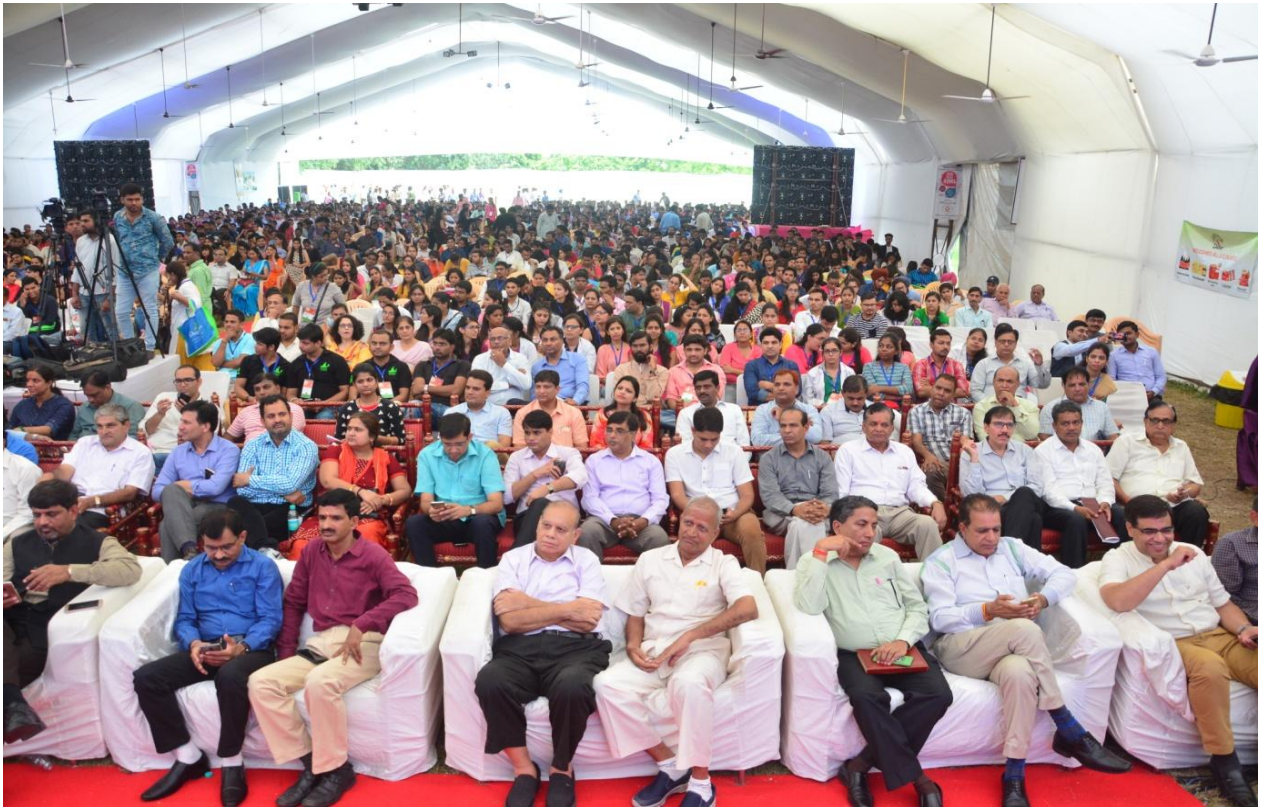
Participants at the 1 st Rashtriya Ayurveda Yuva Mahotsav held in NIA.