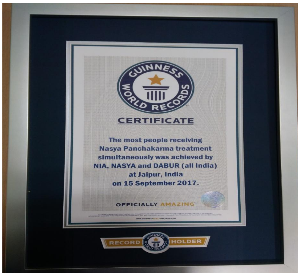
Guinness World Record Achieved by the Institute for the Most People Receiving Nasya Panchakarma Treatment Simultaneously.