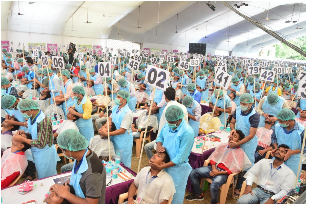
Nasya Panchakarma Treatment being administrated to 800 People simultaneously organised for Achieving Guinness World Record in NIA during the 1 st Rashtriya Ayurveda Yuva Mahotsav.