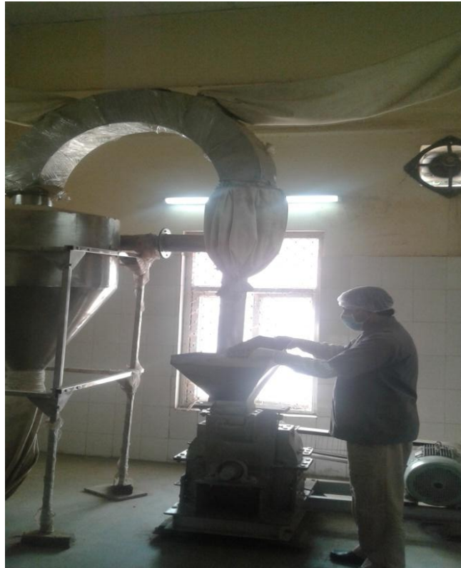
Some of the Machineries used in the GMP Certified Pharmacy of the Institute. Micro Pulvisor(Above) and Pouch-Making Machine(Below)