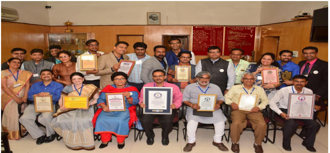
Celebrating the Award of Guinness World Record