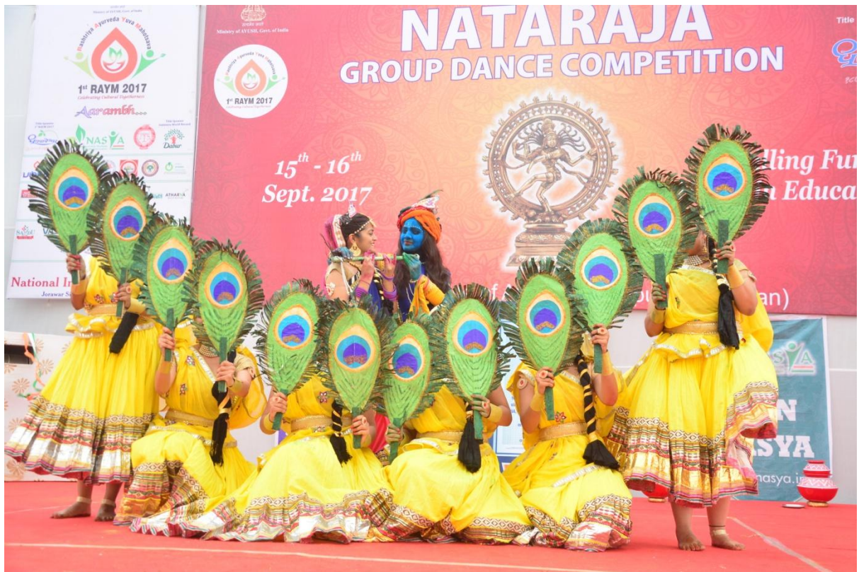
From the Cultural Programs organised by Students of Ayurvedic Colleges from various States on the occasion of 1 st Rashtriya Ayurveda Yuva Mahotsav