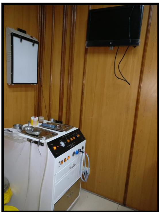
ENT OPD Unit