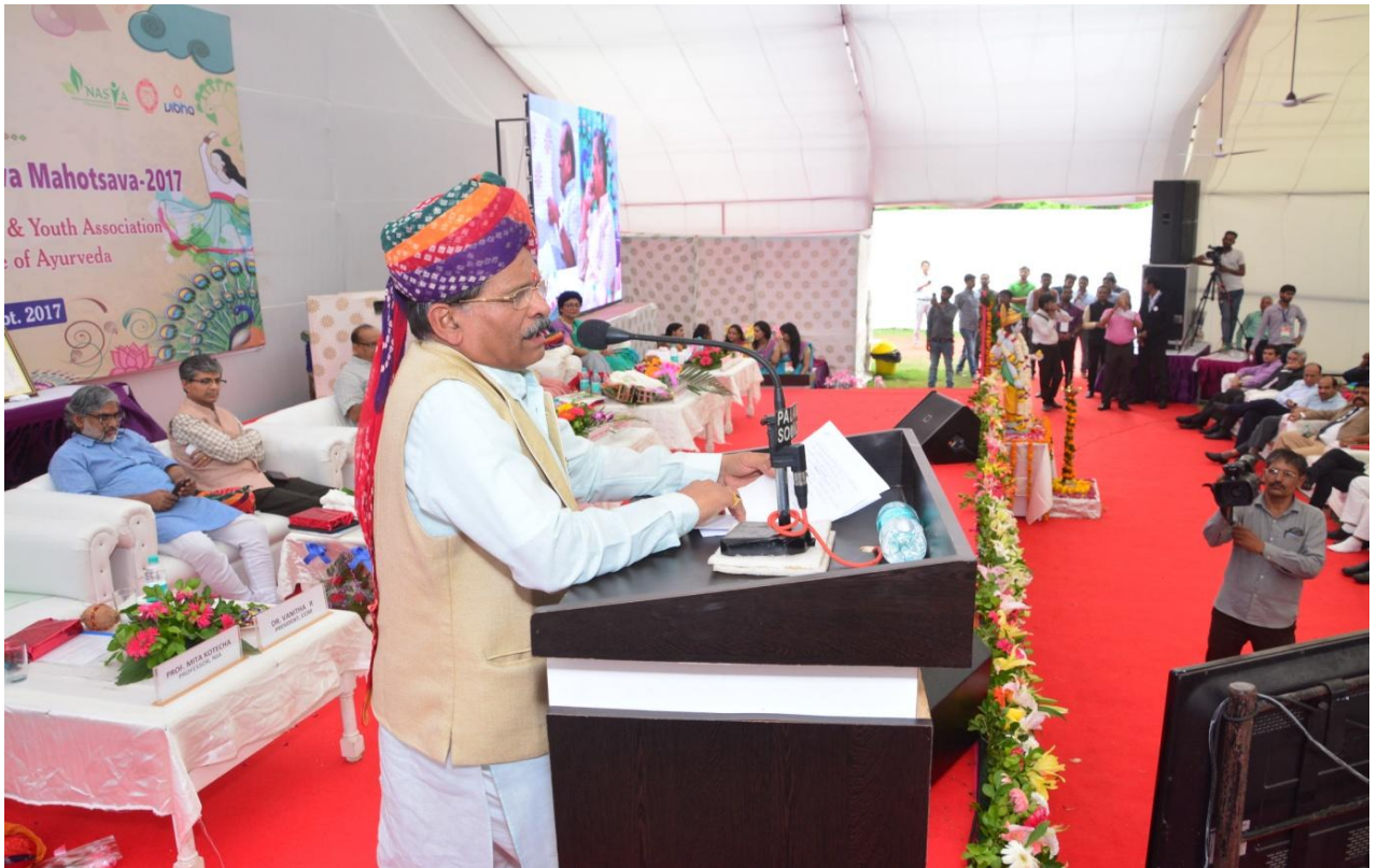
Shri Shripad Yesso Naik, Hon'ble Union Minister of State for AYUSH(Independent Charge) delivering the Inaugural Speech on the occasion of 1 st Rashtriya Ayurveda Yuva Mahotsav in NIA.