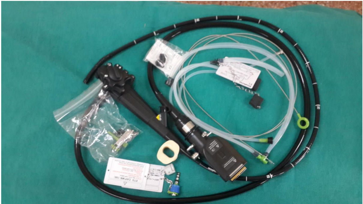
Some of the Instruments being used in the Department of Shalya Tantra for Teaching and Patient Care Activities. (Endoscope(Above) and Endoscope and Colonoscope Monitor(Below))