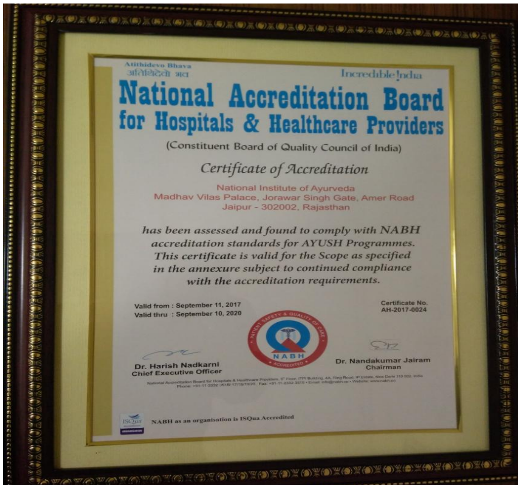
The NABH Accreditation Certificate Awarded for the NIA Hospital by National Accreditation Board for Hospitals & Healthcare Providers.