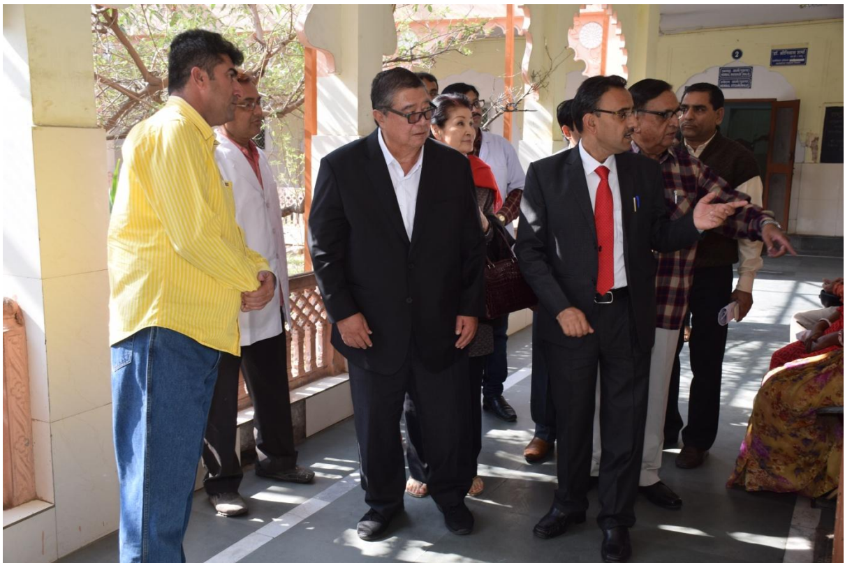
Tun Dr. Ling Liong Sik, Council Chairman of the Universiti Tunku Abdul Rahman during a visit to the Institute Hospital.