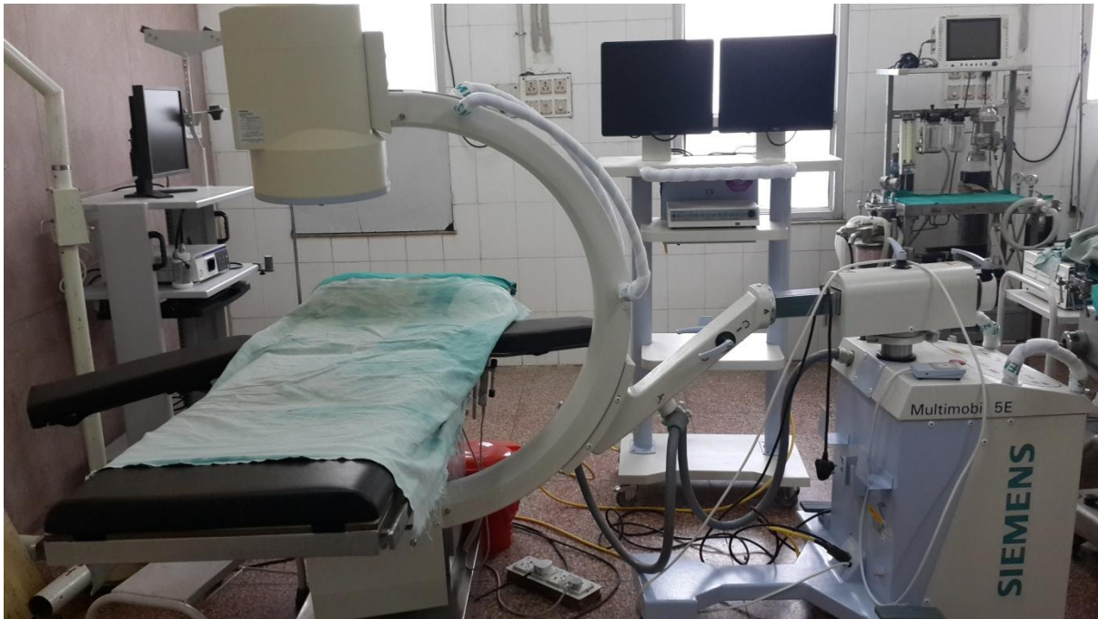
Some of the Instruments being used in the Department of Shalya Tantra for Teaching and Patient Care Activities. (C-Arm(Above) and Colonoscope(Below))